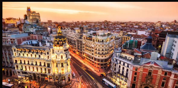
In Europe, the LCC18 and ZIRAT27 seminars will be hosted by Iberdrola Generacion Nuclear in Madrid and will be held on the Iberdrola Campus in San Agustin de Guadalix. The LCC18 and ZIRAT27 Seminar will be held on April 12-14, 2023.