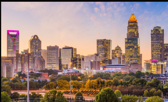
In US, the ZIRAT27 Seminar will be hosted by EPRI, Charlotte, North Carolina, US and will be held during May 2-4, 2023.

A.N.T. International is most grateful to Iberdrola in Spain and EPRI in US, for kindly hosting the Seminars as follows.